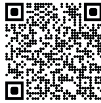
Prednisolone for asthma