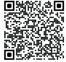
Salbutamol inhaler for asthma and wheeze