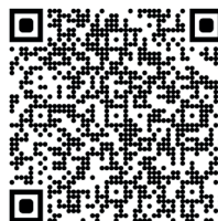
How to apply creams and ointments