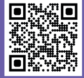
Medicines for Children home page

Medicines for Children provides practical and reliable information about more than 220 medicines used for children and young people. The information addresses frequently asked questions, such as how and when to give the medicine, what to do if you forget to give the medicine, and any possible side-effects. The website hosts many other useful resources and regular news stories.