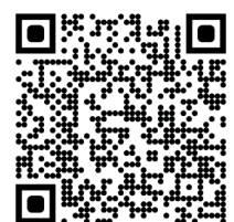
Hydrocortisone cream for eczema