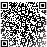
How to give asthma inhalers