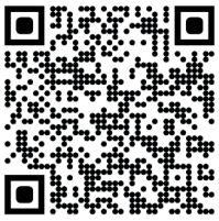
Loratadine for allergy symptoms