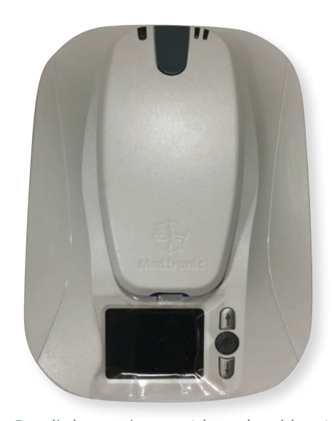
Carelink monitor or 'download box'